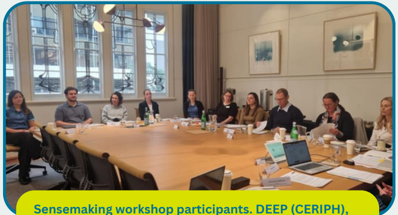
Sensemaking workshop participants. DEEP (CERIPH), WALGA, CCWA, Injury Matters, RLSSWA, ECU, WA Community and Advocacy Network (formerly LDAG Inc)

Collaborators met in late July 2024 to 'make sense' of project results, identifying ideas for future policy, practice and research. Discussions provided key insights toward project findings and implications for policy, practice and research.